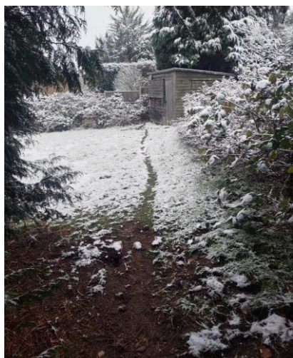
A well used badger path at our Copse sett

Signs of Badgers in the snow - the recent scattering of snow across the county has revealed some night time 'badgery' activity!