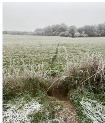
Another popular badger path spotted in West Berks