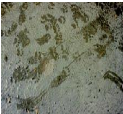
Badger tracks on the icy Copse pond, a few years ago.